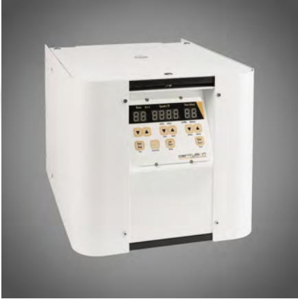
Display indicative only